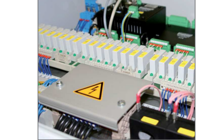
Application specific control device