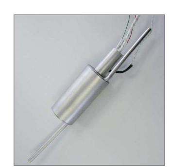
Surface coating carburetor