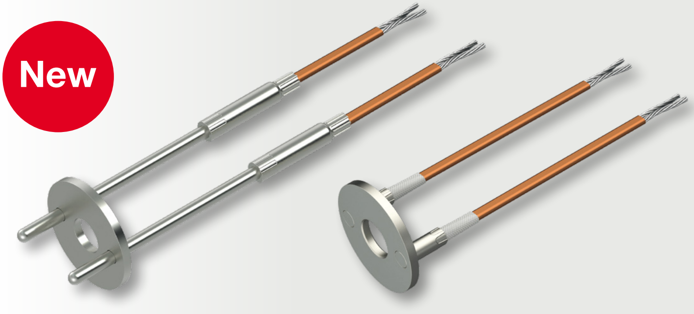
Thermocouples exposed out of ring

The special construction for temperature measurement on heated mold plates, machine components or similar applications enables redundant measurement to minimize measurement errors.